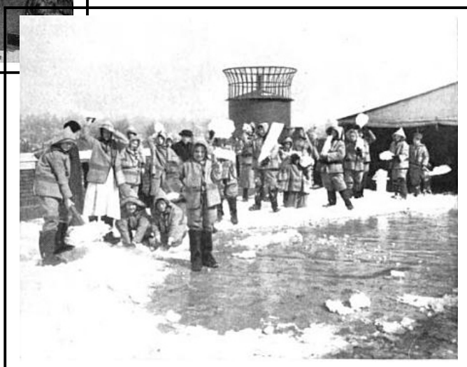
Figure 8: "The Out-Door Class." Lincoln had an outdoor class on the roof for "anemic" children in the area during the era of tuberculosis.