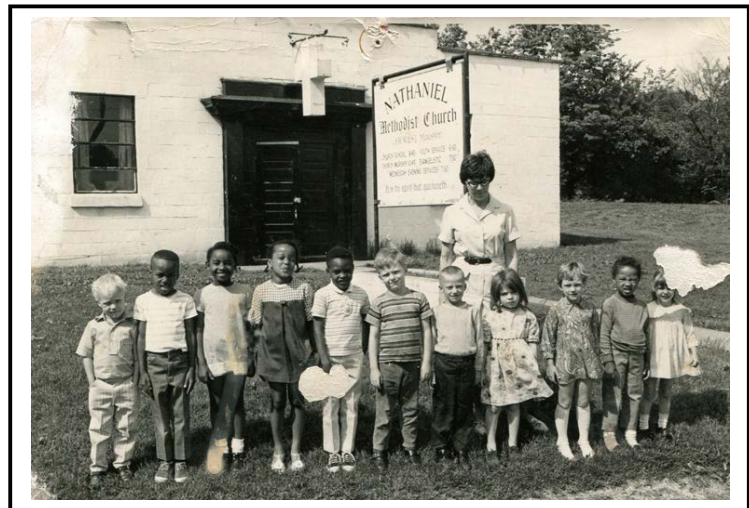
Figure 5: Children in front of Nathaniel United Methodist Mission, 1969.