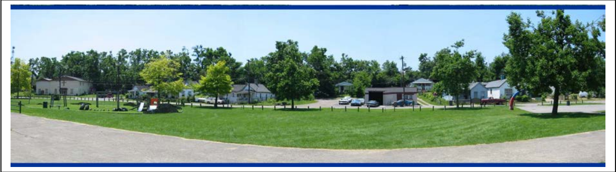
Figure 6: Panoramic photograph of Davis Bottom Park along DeRoode Street, ca. 2000s.