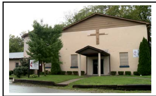
Figure 7: Nathaniel United Methodist Mission, 2012.