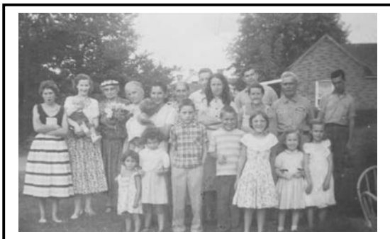
Figure 8: Nathaniel congregation members, 1956.

In 1979, Nathaniel started a free medical clinic with one volunteer doctor working out of the furnace room. Today, dozens of physicians and volunteers donate their time to the Nathaniel Mission and Refuge Clinic, which serves about 2,200 patients each year. Nathaniel provided 12,000 “mission” visits in 2012 for meal programs, special holiday events, educational programs and a veterinarian clinic. The mission plans to move to temporary quarters during the final phases of road construction, and then build a new facility in the heart of Davis Bottom.