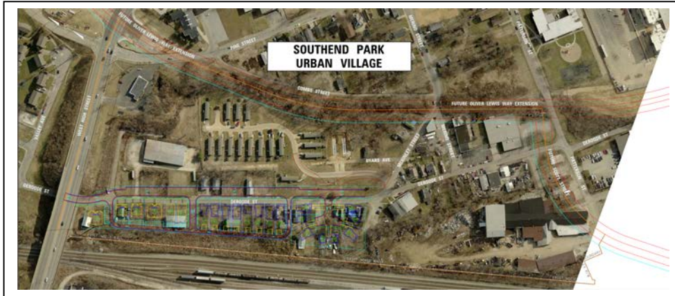
Figure 9: Plan for South End Park Urban Village (as of 2013) showing approximate locations of new homes and roadways.

On October 11, 2007, government officials approved a final plan (Record of Decision) for the Newtown Pike Extension Project. The road is being built in phases to retain community cohesion. Residents displaced by construction have been provided temporary homes on the grounds of the Davis Bottom Park. The Lexington Community Land Trust was formed in order to help residents purchase new homes in what will become the South End Park Urban Village. Project details are available on the Newtown Pike Extension website: newtownextension.com .